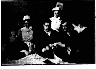
A HAND AT NAP.

How the Wounded Soldiers Amuse Themselves at Wellingborough.