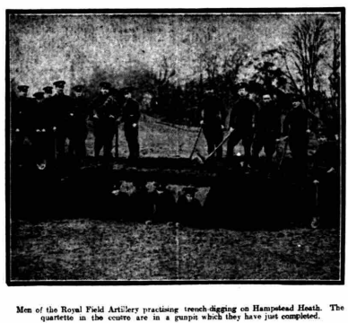
Mem of the Royal Field Artillery practicing trench-digging on Hampstead Heath. The members in the centre are in squads which they have just completed.